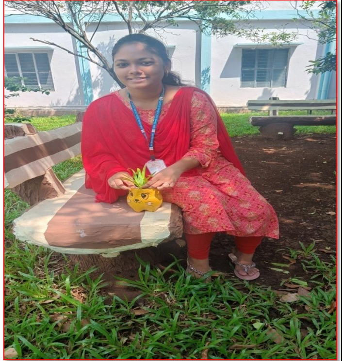
G RIYA FLORENCE II-BT.BC.C