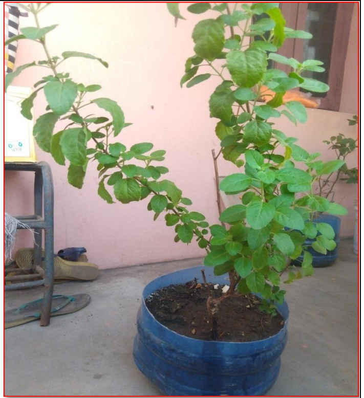
SK. NAZEER I-MB.BT.BC