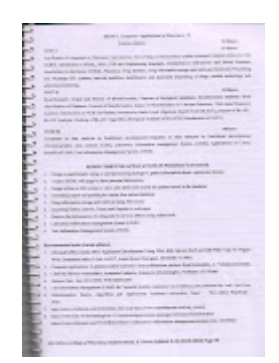
CAP-II, Syllabus, R19 .jpg 3932K